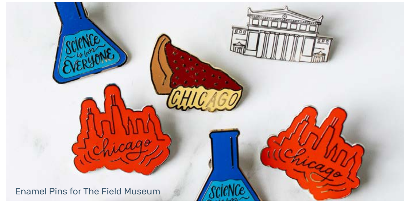
Enamel Pins for The Field Museum